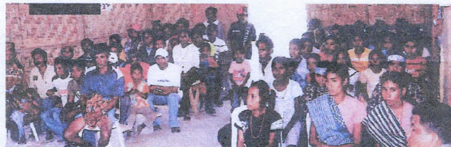
Sumba Wesleyans worshipping in one of their temporary churches.

Please join us in praying that a great revival will sweep through the island of Sumba and that many will come to know Christ as their personal Savior. Pray that wisdom from the God of heaven will saturate the spirit of the JESUS film team.